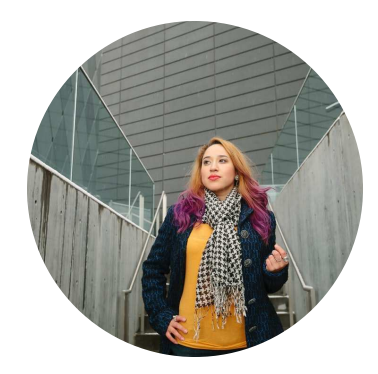
27% of HFAz mothers were employed full- or part-time at their child's birth. Two years later, 47% were employed.